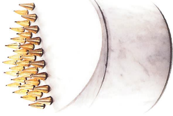
Arete Collection cylinder box with spikes.

"Some notable pieces that I will have for sale will include a French Art Deco cabinet from the 1930s made of rosewood and parchment. Each door and drawer has a small brass key in which it can be locked."