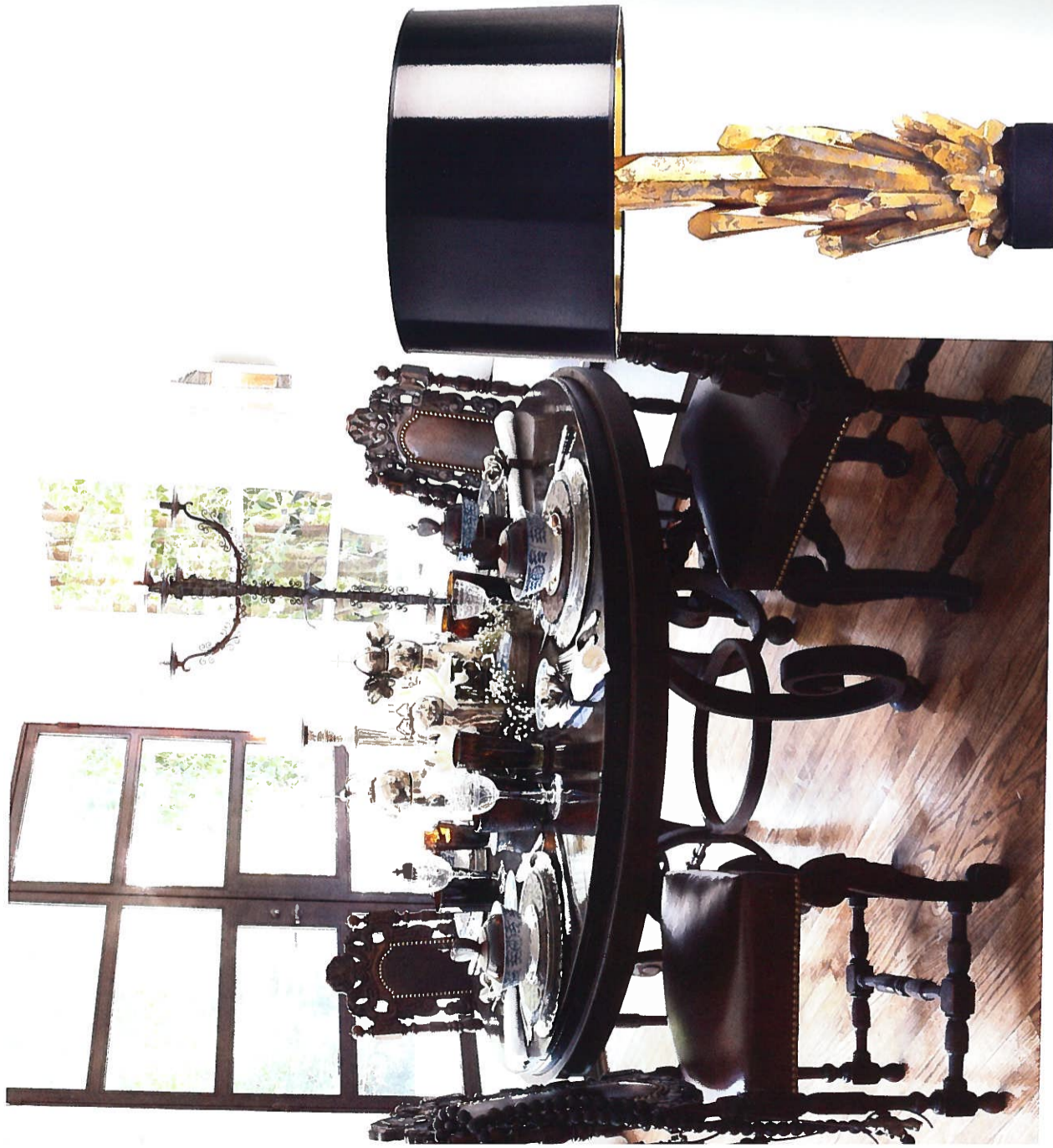
o will be one of the featured designers at For Home.

re various spaces of For Home with dynamic work from n Gallery."